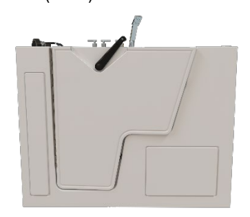
Door Handle Unlocked Position