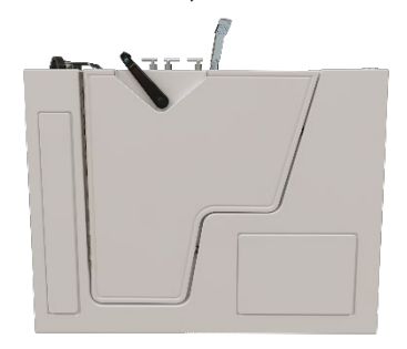
Door Closed Door Handle Locked Position