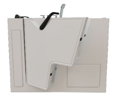
Door Left Open Maintains seal life when not in use.