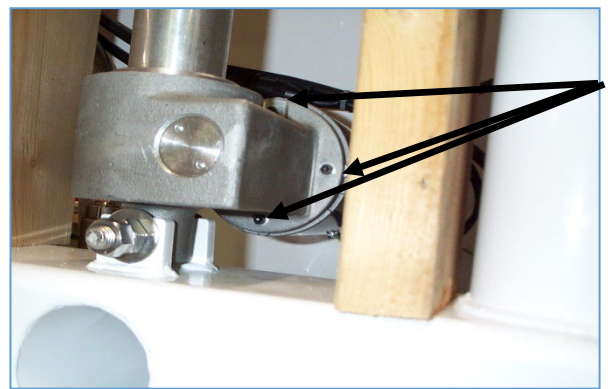
Figure E, is view from the front, with Panel raised and wood supports inserted. The three Socket head screws are accessible as indicated. These must be removed and saved for re-installation using Ball Drive 3911223.