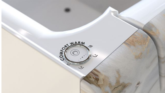
Heated Seat/Back Control (3 heat levels)