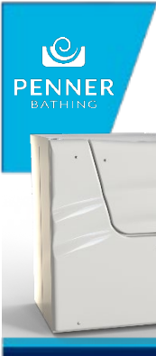
Table Of Contents Safe Operation & Maintenance Manual 760750 Rev A