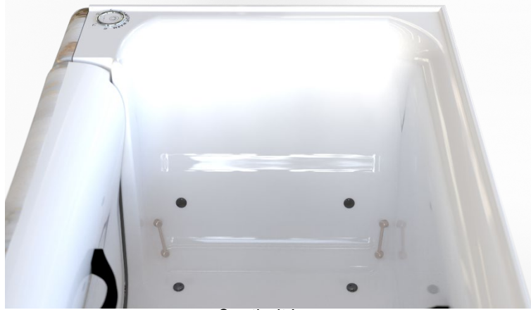
Seatbelt Loops (Commercial only)

The Dream Spa Door is a specially designed reinforced door with a locking lever to open and close the door by the resident or operator. Door must be left open when not in use to allow seal to maintain integrity.