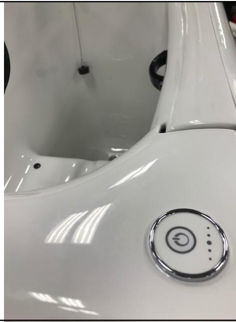
Figure 3-Heated Seat/Back Button

The DREAM SPA Door is a specially designed reinforced door with locking lever to open and close the door by the resident or operator.