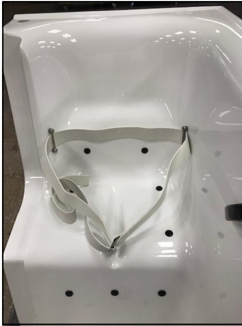
Figure 2-Seat Belt and Holders